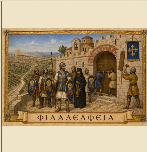
His seat, as our man hath drawn it

He keeps the night watch in person through the dark seasons and holds the gate-keys himself at dusk. He desires no diadem and would be insulted by the offer of one; he asks only that the bells of Philadelphia ring in Greek hands, and that the gate be shut against Frank and Türkmen alike. A man whose loyalty is easily had by him who can show forth the imperial seal and the Orthodox cross together.