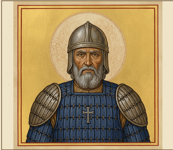
From a miniature kept in the chancery

Of the wall of Philadelphia — captain of the militia-saints of Philadelphia