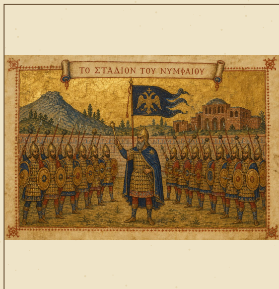
His seat, as our man hath drawn it

An old soldier of the Komnenian wars who has buried two emperors and outlived his usefulness to all but the present hour. He bears the Latin the cold and patient hatred of a man who lost his sons before the walls of the City. He keeps the drill-yard at Nymphaion in the old discipline, and has not been seen to smile since the news from Pera. Honest legitimacy and a shared enemy are the two coins that buy him.