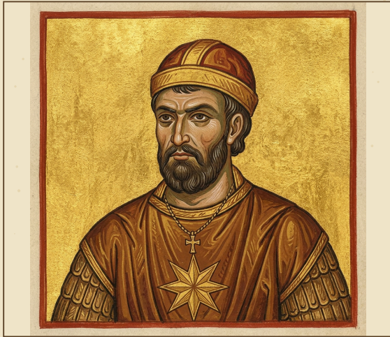
From a miniature kept in the chancery

Lord of Chōnai — father-in-law to the Sultan at Iconium