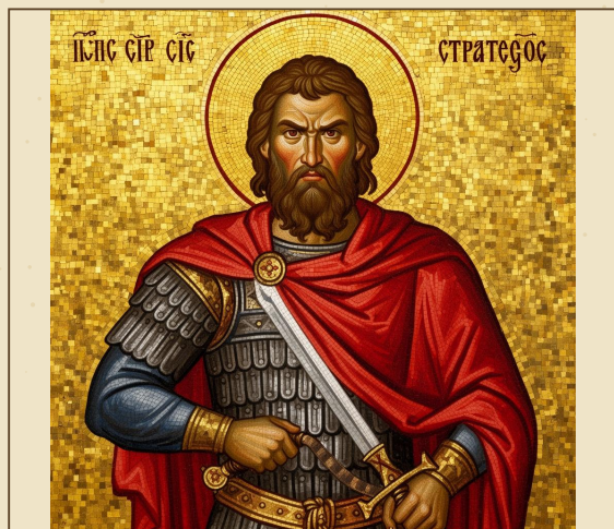
From a miniature kept in the chancery

Strategos of Nymphaion — last strategos of the Thrakēsion