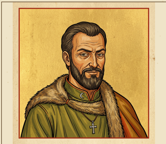
From a miniature kept in the chancery