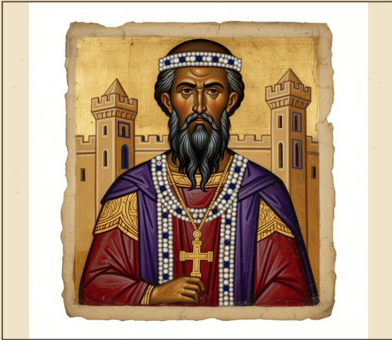
From a miniature kept in the chancery

Archon of Philadelphia — called Morotheodōros by the demos