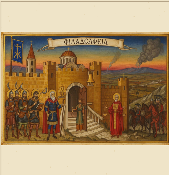
His seat, as our man hath drawn it

Toward the Latin he bears the hate proper to a Roman; toward the house of Komnenos and its kinsmen he carries the older grudge of a wool-merchant's son for the courtiers who would not have his coin. Let him be approached not as a vassal but as a king who has not yet been crowned. His joints, we are told by those who keep his household, no longer bear a hard winter ride.